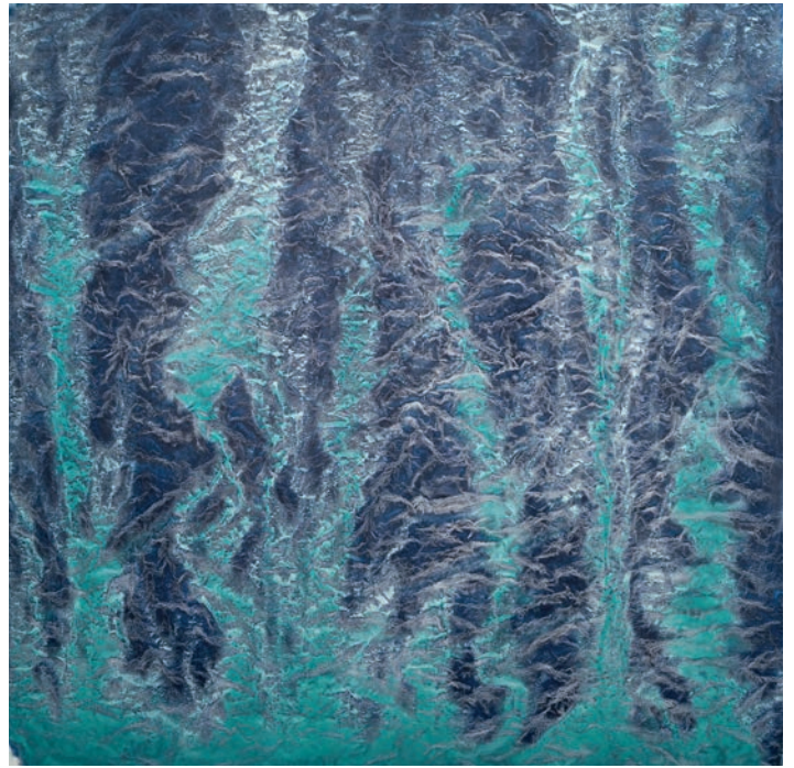
10. Vicky Colombet, Wisteria #1423-19 – 2019 – Oil, pigments (Ultramarine Blue R6, Cobalt Violet Dark, Titanium White, Cobalt Oxide Green Blue, Ivory Black) and alkyd on canvas – 152.4 x 152.4 cm