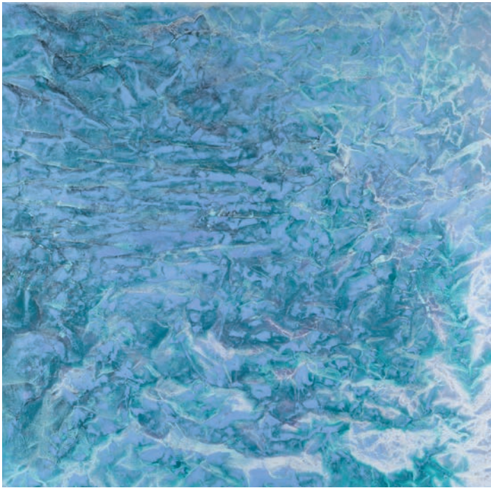
5. Vicky Colombet, From the floating world series #1431 – 2020 – Oil, pigments (Mars red, Ultramarine Blue R4, Ultramarine Violet Medium, Titanium White, Iron Oxide Black, Cobalt Oxide Green Blue) and alkyd on canvas – 91 x 93 cm – New-York, collection Claire N.Creatore