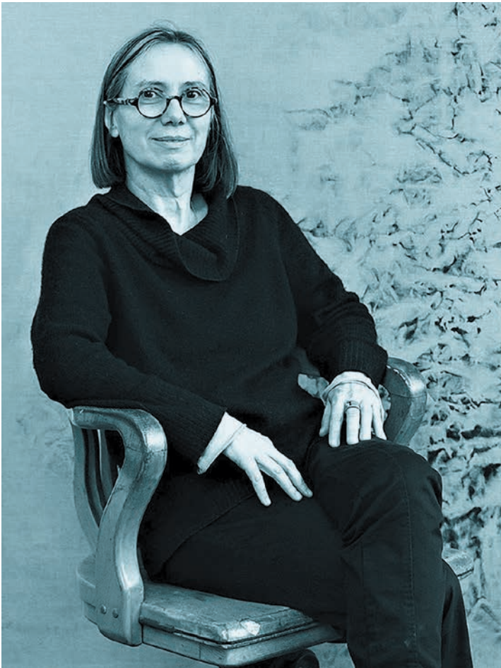
11. © Nousha Salimi – © RMN-Grand Palais (Institut de France) / Gerard Blot