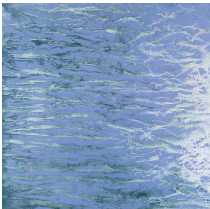
Vicky Colombet, From the floating world series #1436 – 2020 – Oil, pigments (Mars red, Ultramarine Violet Medium, Titanium White, Iron Oxide Black, Cobalt Oxide Green Blue) and alkyd on canvas – 91 x 93 cm – New-York, collection Dorothea Elkon et Salem Grassi

An artist's life has its decisive moments: Monet discovering outdoor painting with Boudin; Kandinsky coming upon one of Monet's Haystacks, Rodin dazzled by the Cambodian dancers. We also know all about the power of attraction that certain places can exert on the creative spirit, be it Lake Sils for Nietzsche, a Norwegian cabin for Wittgenstein, or Descartes' famous poêle. These are the theaters of inner experience and revelation.