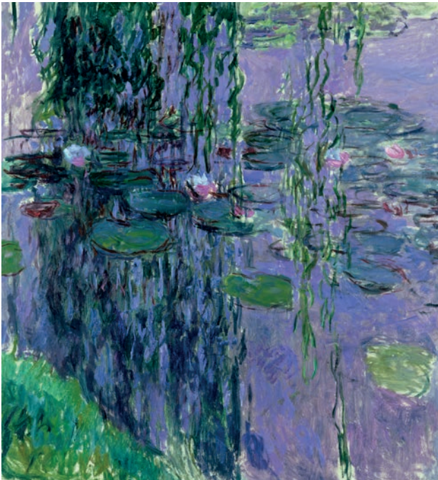
1. Claude Monet, Water Lilies – 1916-1919 – Oil on Canvas – 150 x 197 cm – Paris, musée Marmottan Monet