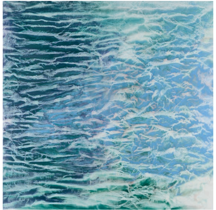
6. Vicky Colombet, From the floating world series #1437 – 2020 – Oil, pigments (Mars red, Ultramarine Violet Medium, Viridian Green, Titanium White, Iron Oxide Black, Cobalt Blue Matte) and alkyd on canvas – 91 x 93 cm