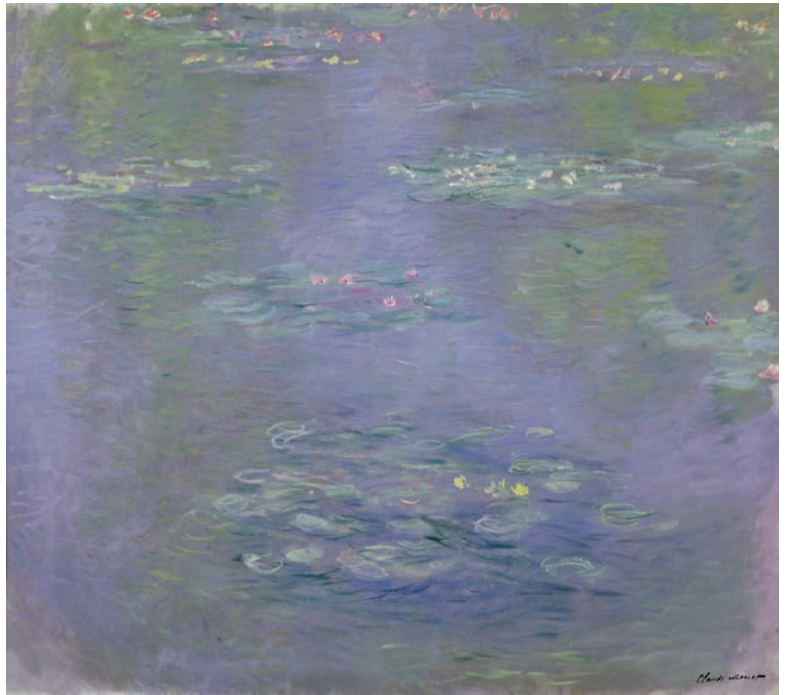
2. Claude Monet, Water Lilies – 1903 – Oil on Canvas – 150 x 197 cm – Paris, musée Marmottan Monet