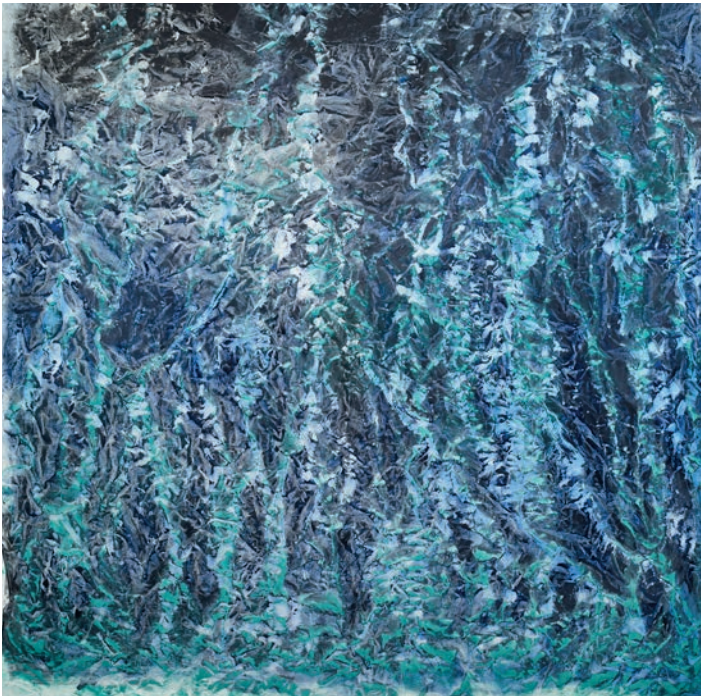
9. Vicky Colombet, Wisteria #1417-19 – 2019 – Oil, pigments (Iron Oxide Black, Titanium White, Cobalt Oxide Green Blue Dark, Ultramarine Blue R2) and alkyd on canvas – 182.8 x 182.8 cm – © Christian Baraja SLB