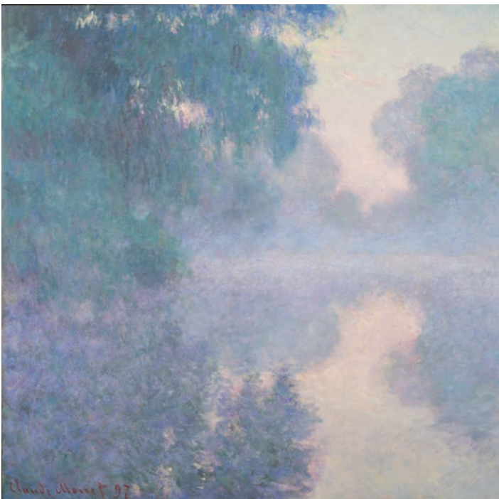
3. Claude Monet, Arm of the Seine near Giverny at Sunrise – 1897 – Oil on canvas 91 x 93 cm – Long-term loan from the Fondation Ephrussi de Rothschild, 1993