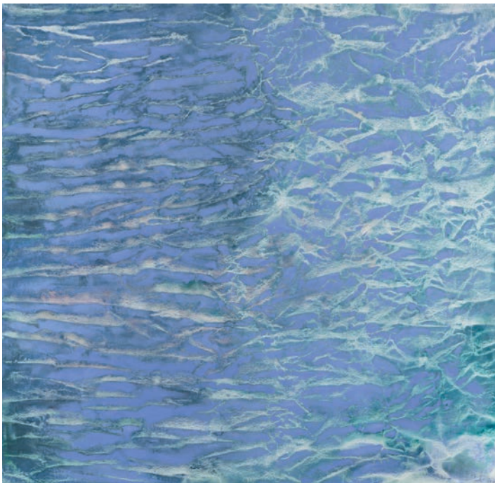
7. Vicky Colombet, From the floating world series #1438 – 2020 – Oil, pigments (Mars red, Ultramarine Blue R4, Ultramarine Violet Medium, Titanium White, Iron Oxide Black, Cobalt oxide Green Blue) and alkyd on canvas – 91 x 93 cm – New-York, collection James Rosenthal et Kathy Bishop