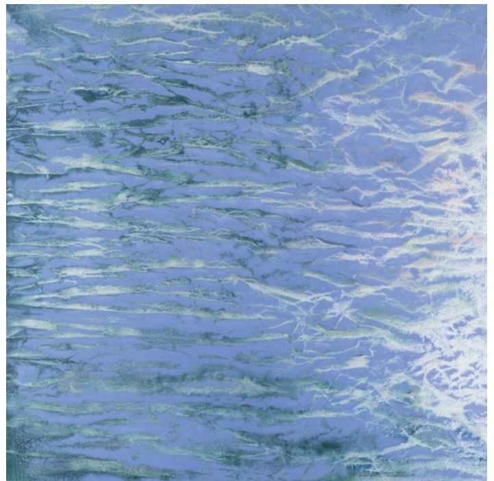
4. Vicky Colombet, From the floating world series #1436 – 2020 – Oil, pigments (Mars red, Ultramarine Violet Medium, Titanium White, Iron Oxide Black, Cobalt Oxide Green Blue) and alkyd on canvas – 91 x 93 cm – New-York, collection Dorothea Elkon et Salem Grassi – © Bryan Zimmermann